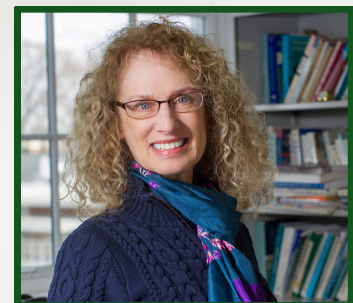
(Co-authored with the late Dianne Ashton)

$20 per person - includes lunch & book talk